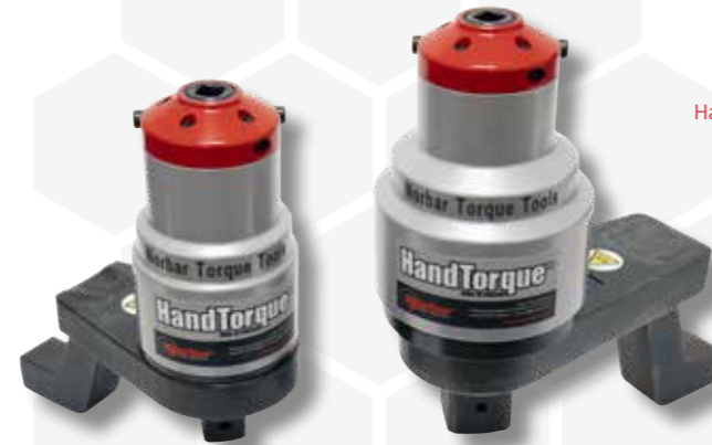
Compact Series HandTorque® Multipliers