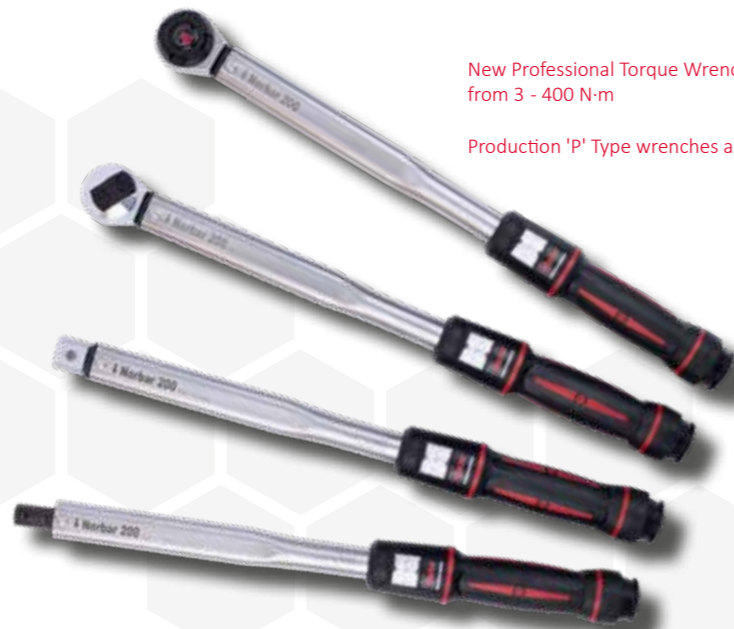
New Professional Torque Wrenches range from 3 - 400 N-m