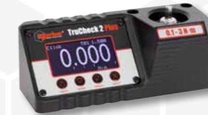
Above: TruCheck™ 2 Plus 0.1 - 3 N-m