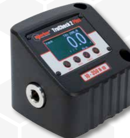
Below: TruCheck™ 2 Plus 10 - 350 N-m