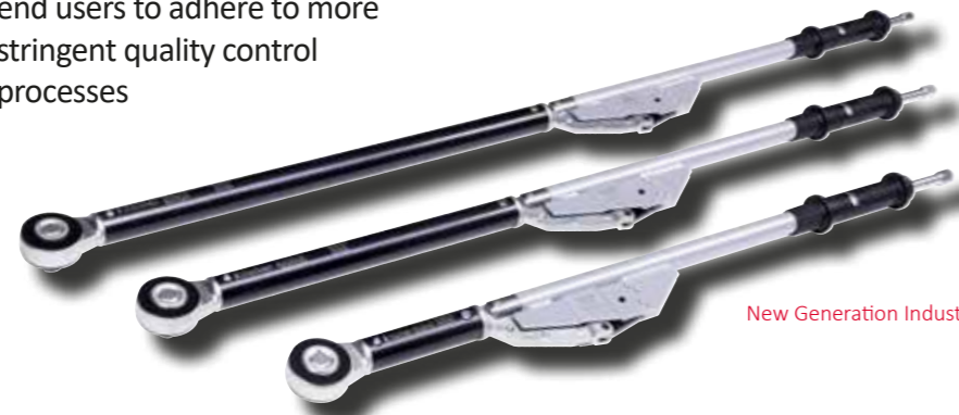
New Generation Industrial