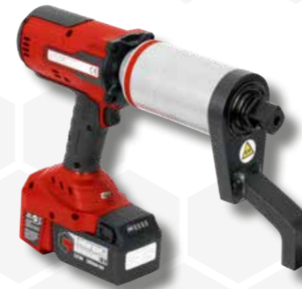
EvoTorque® Battery Tool