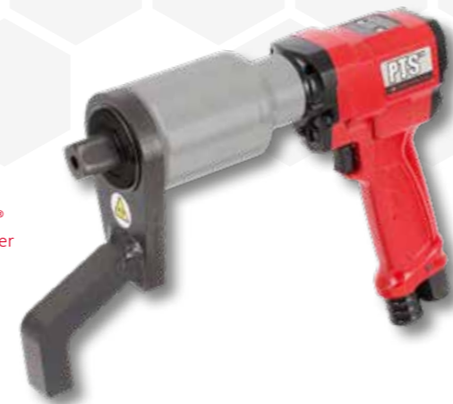
PneuTorque® PTS™ Multiplier